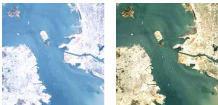
Figure 3-1 Example of LEDAPS atmospheric correction. Left, Top of Atmosphere (TOA) Reflectance composite (bands 3,2,1) for Landsat-7 ETM+ image of San Francisco Bay (July 7, 1999); Right, Surface Reflectance composite. Both images are linearly scaled from p = 0.0 to 0.15 .

The LEDAPS code is maintained by the USGS Earth Resources Observation and Science (EROS) Center as open source software and is available at https://github.com/USGS-EROS/espa-surface-reflectance/tree/master/ledaps . LEDAPS is implemented in the USGS EROS Science Processing Architecture (ESPA) as fundamental input to the development of higher level data products such as burned area, surface water extent, and snow covered area. Generation of many of these higher level data products requires further processing of Surface Reflectance to spectral indices.