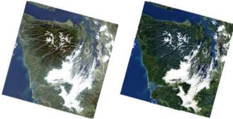
Figure 3-2: Example of LaSRC atmospheric correction. Left, Top of Atmosphere (TOA) Reflectance composite (bands 4,3,2) for Landsat 8 image of Northwest Washington State (October 14,2013); Right, Surface Reflectance composite.

https://landsat.usgs.gov/sites/default/files/documents/lasrc_product_guide.pdf .